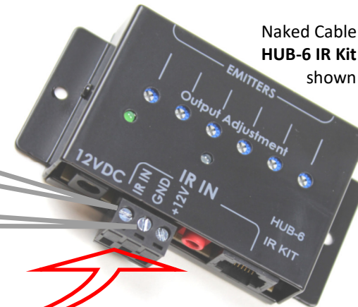
Naked Cable HUB-6 IR Kit shown